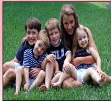
The Zampiello Family